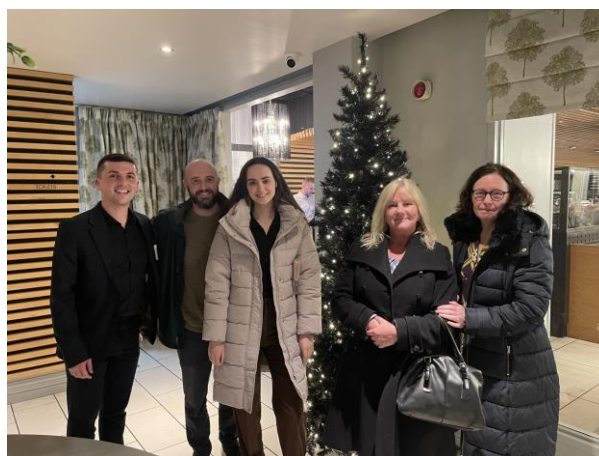
1 - Happy New Year from The CHOICE Research Team at Queen's University Belfast!